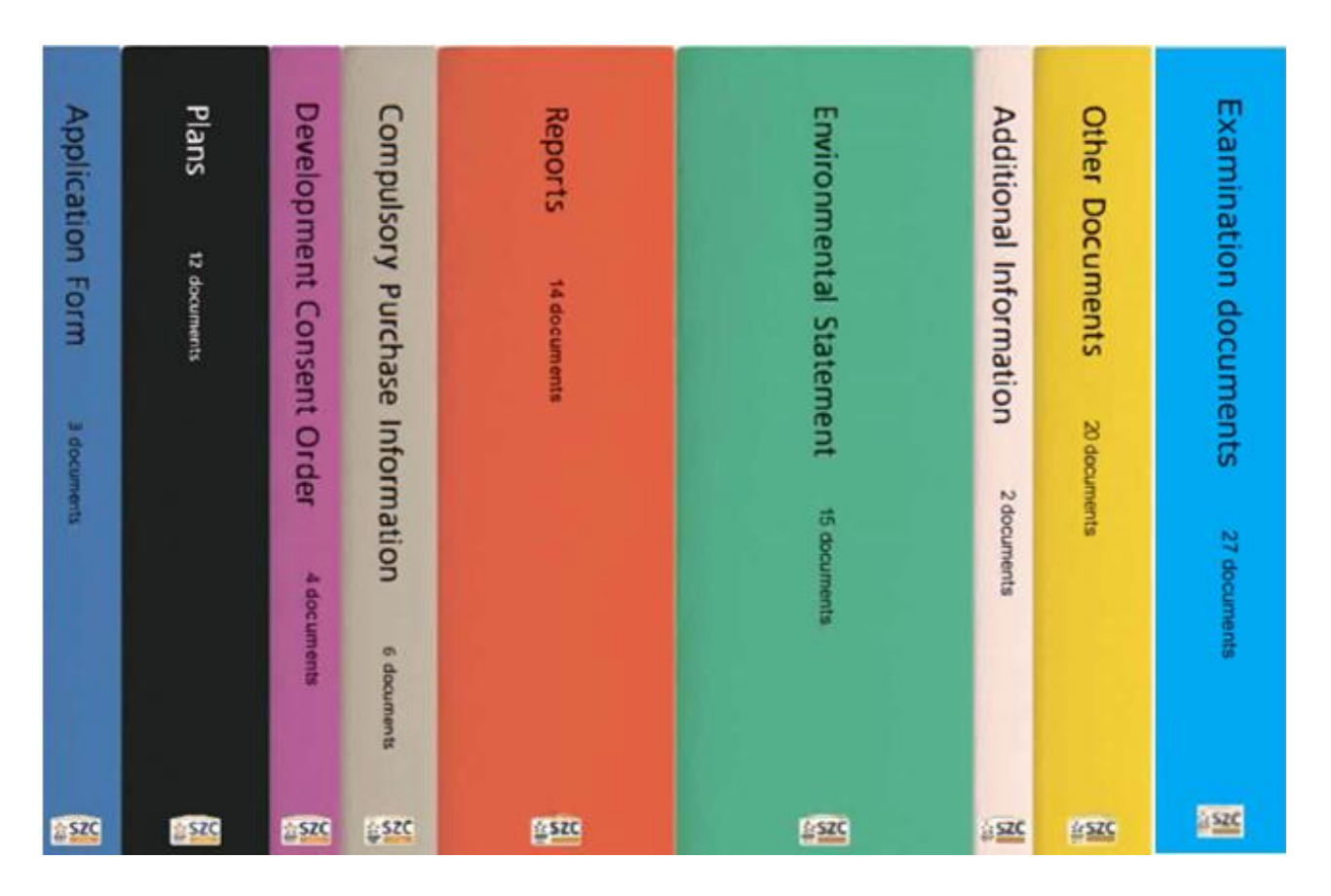
Table 1.1: Book 1 Application Form